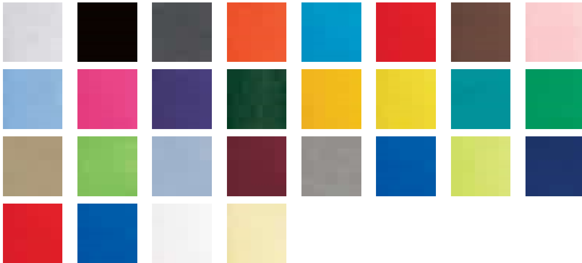
29M ADULT 5.6 OZ 50/50 TEE

**Find this item on Page 169 in our 2011 Catalog**