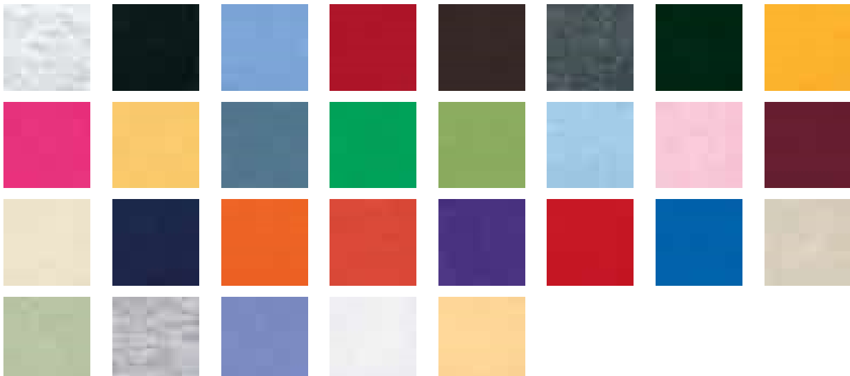
18000 ADULT HEAVY BLEND CREW: Gold

**Find this item on Page 256 in our 2011 Catalog**