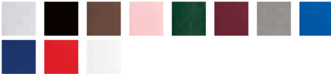
993M ADULT MIDWEIGHT FULL ZIP HOOD

**Find this item on Page 258 in our 2011 Catalog**